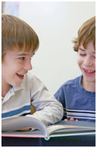
Children are 'Our Business'

It is our sincere goal to transport your student(s) to and from school in the safest most professional manner as possible. As a part of the educational team at Ravenna Public Schools, we are committed to excellence.